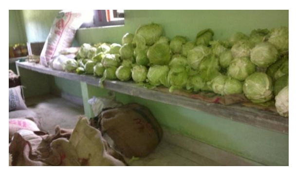
Figure 2. Vegetables stored in the kitchen on the cementshelves at the sport event venue in Bumthang, Bhutan, 2012

Fresh food, such as meat, cheese, vegetables and chilies, were brought in from a bordering Indian town and kept for up to one week on the cement shelves adjacent to the kitchen (Figure 2). Refrigeration was not available, and daily temperatures varied between approximately 12.2-22.3°C. Meals were prepared on a daily basis and were not kept overnight. None of the participants reported bringing foods from outside the school.