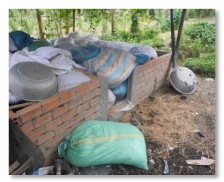
(b) Inappropriate storage of rice packs to be used for noodle preparation

Laboratory results revealed high level of Staphylococcus aureus and Bacillus cereus in multiple samples of old (first day) and new (second day) Khmer noodles and flour. These results implied potentially injurious contamination levels and were unfit for human consumption according to British Health Protection Agency guidelines for assessing the microbiological safety<sup>7</sup> (Table 3).