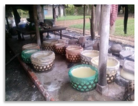
(e) Inappropriate storage of uncut noodles at the factory

contaminated multiple points along the line of noodle production such as broken and dirty water supply system, pots on the ground by the muddy stream, and animals in the factory (Figure 3). One factory employee reported that neighbors sprayed pesticides a week before the outbreak. The neighbors also complained that the noodle factory smelled bad, especially after the rain.