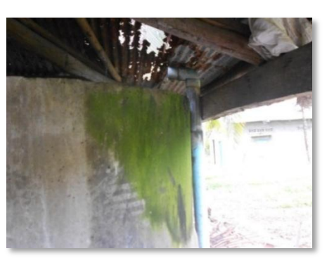
(d) Broken water supply at the noodle factory