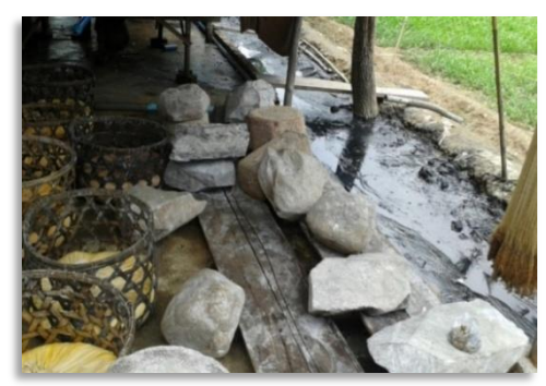
(c) Contaminated drainage system at the noodle factory