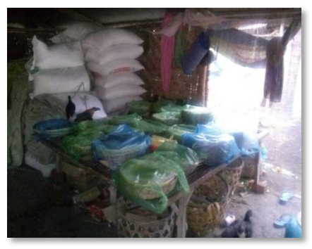
(f) Uncovered Khmer noodle pots accessed by animals

Figure 3. Noodle production from the implicated factory in Kandal Province, Cambodia, 29 Jun - 1 Jul 2014