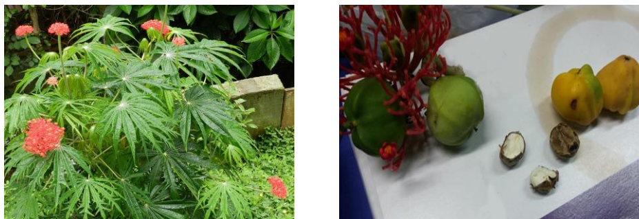
Figure 3. A Jatropha tree (left) and its seeds (right) from the herb garden of a primary school in the northern Thailand, October 2015